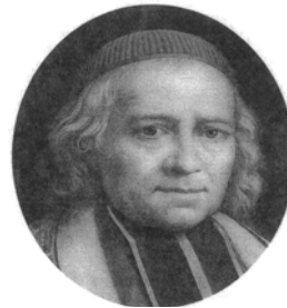
Blessed William Joseph Chaminade 1761-1850